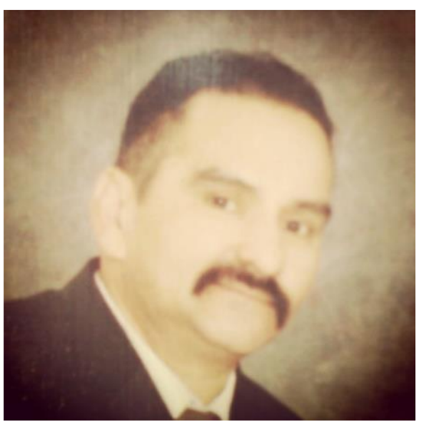
Example of poor quality photo