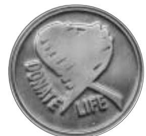
HHS National Medal of Honor